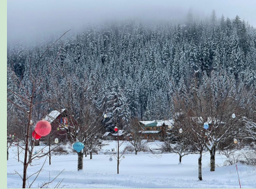
We've put ornaments in bare trees along our driveway

May the Infinite Light of Wisdom and Compassion so shine within us that the errors and vanities of self may be dispelled; so shall we understand the changing nature of existence and awaken into spiritual peace.