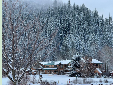
Our hillsides are a winter wonderland