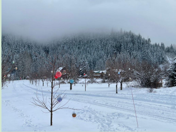
Lots of snow at the Abbey