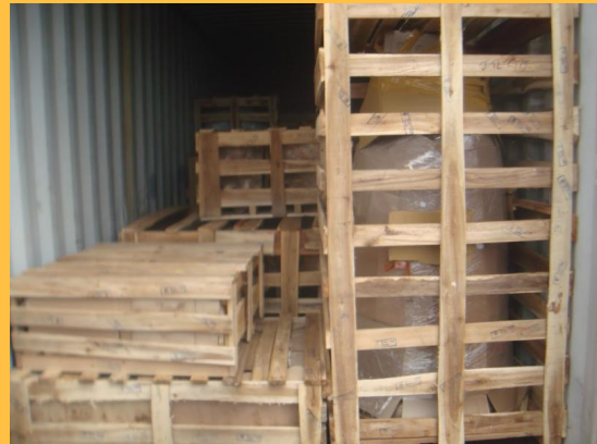
The statues arrived at our temple in good shape with no apparent breakage.