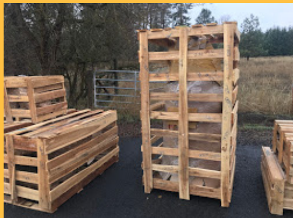
Our shipment came in a full 40ft shipping container. It was a lot of work to unload the statues and then move them into storage. We rented a huge forklift to do so.