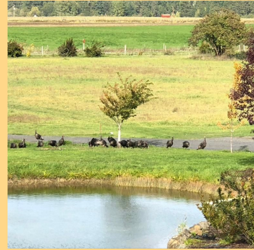
Wild turkeys walking down our drive

May the Infinite Light of Wisdom and Compassion so shine within us that the errors and vanities of self may be dispelled; so shall we understand the changing nature of existence and awaken into spiritual peace.