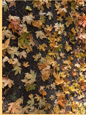
Even in dying the leaves are beautiful