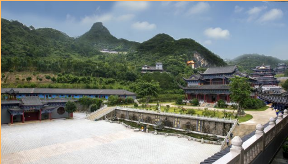
Dong Hua Temple