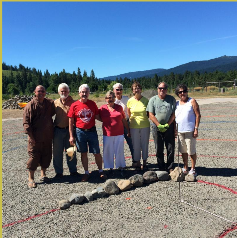
The first stones have been placed for the paths of the Labyrinth. It will be used by people of many faiths to help them quiet their minds. Our temple will use it as part of our regular walking meditation practice.