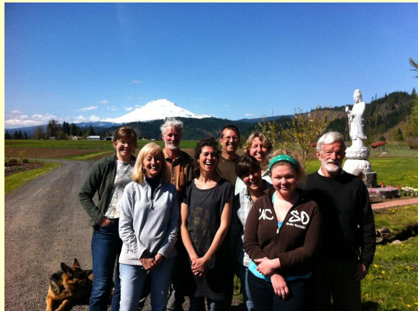
The Gorge Grown Food Network met here for a Board retreat. Good folks helping us to find good local food and to act locally and think globally.

These individuals are recommended because of the quality of their practice, not because of any religious beliefs.