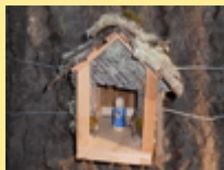
Jizo Shrine getting ready to go on th3 Pacific Crest Trail Food Cache