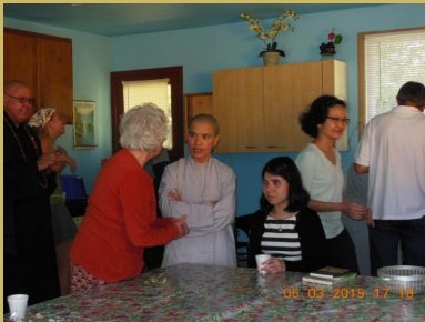
After services tea and social time

Buu Hung Monastery is a lovely temple in Vancouver WA. It is about a 1.5 hour drive from Trout Lake, WA