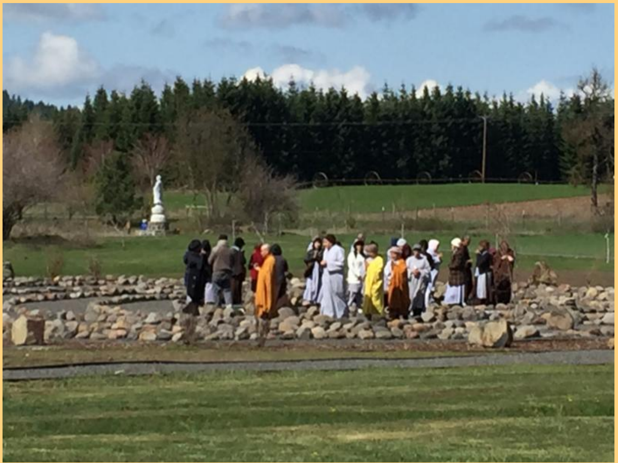
Our Labyrinth is used by people of many faiths. In this photo a Buddhist walking meditation is being done as part of our morning service. We're all bundled up as it has been chilly in the mornings. Please feel free to stop by and walk the labyrinth whenever you can - it is a most wonderful practice.