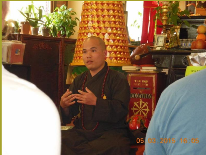
Giving a Dharma talk in English