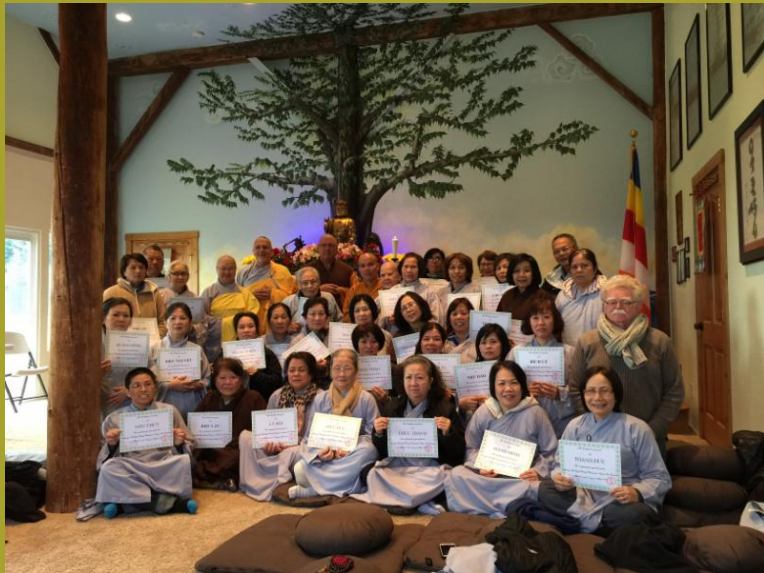
Attending a Precepts Retreat

Buu Hung Monastery is a lovely temple in Vancouver WA. It is about a 1.5 hour drive from Trout Lake, WA