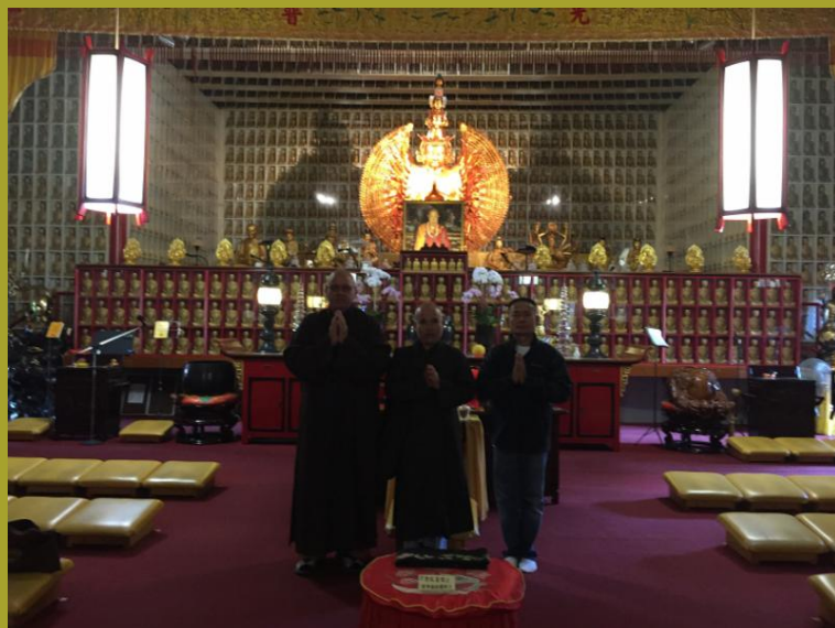
Visiting the City of 10,000 Buddhas