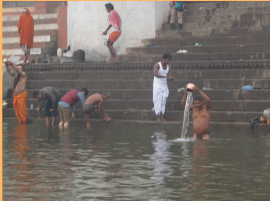
Sacred bathing in the Ganga (Ganges River) in Verinasi.