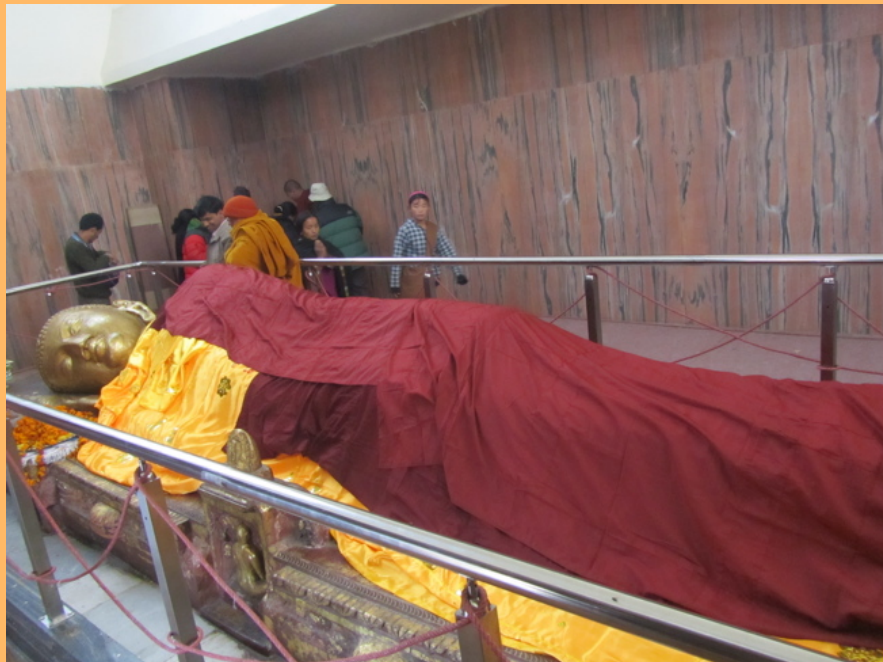
Kushinigar. The death place of the Buddha, Buddha's parinirvana. We brought back a robe that covered this statue with us to our temple, to use in special ceremonies.