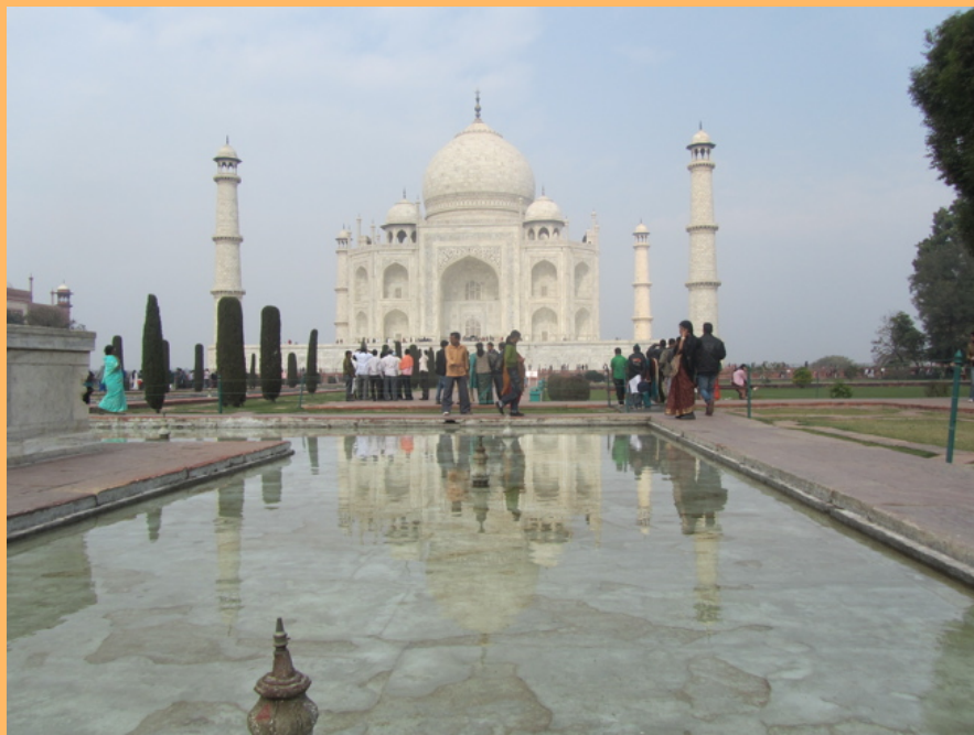
The beautiful memorial to love - the Taj Mahal.

26: Day production and use of biological weapons was outlawed world-wide