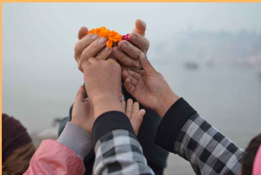
Here we are in a small wooden boat floating on the Ganges. Our group is holding a flower offering to place in the Mother Ganga - asking for peace for all beings.

"There is no beginning to practice nor end to enlightenment; There is no beginning to enlightenment nor end to practice."