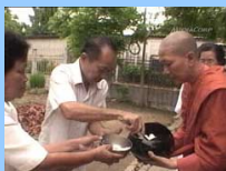
Monk receiving dana