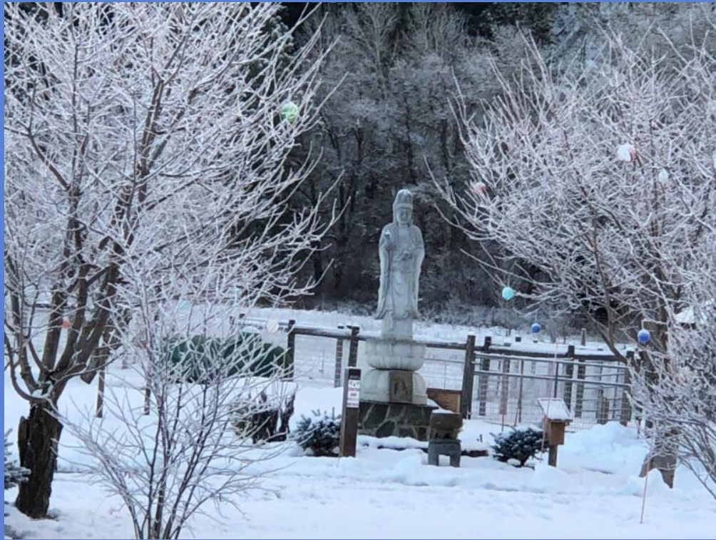
Avalokiteshvara, Guānshīyīn Púsà, Quán Tỳ Tậ Bồ Tát in the snow Dec 2018